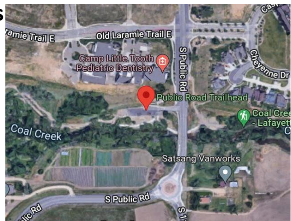
S. Public Trailhead Road