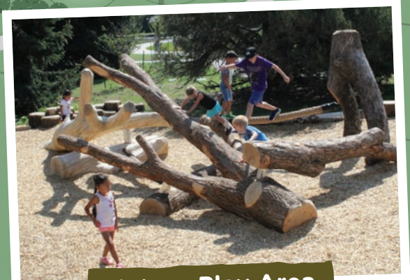
Nature Play Area